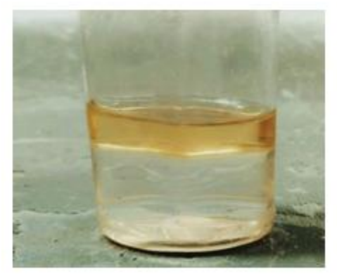
Fig-2: Layer of D-limonene obtained